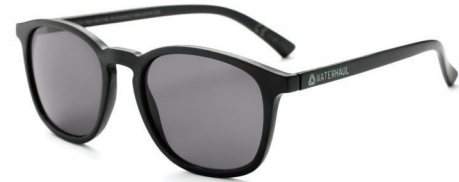
Kynance Grey (Mineral Glass Lenses - Polarised)