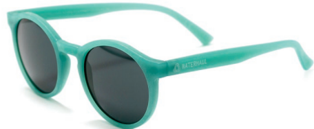
Harlyn Grey (Mineral Glass Lenses - Non Polarised)