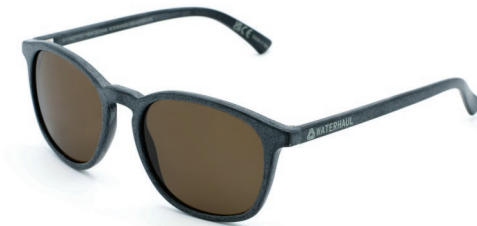
Kynance Brown (Mineral Glass Lenses - Polarised)