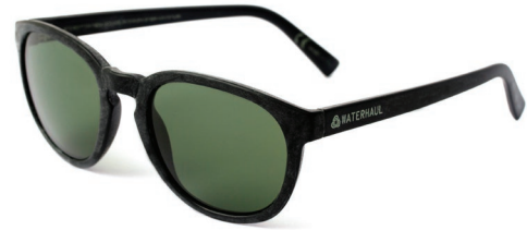
Crantock Grey (Mineral Glass Lenses - Polarised)