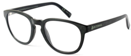
Crantock Frame Only