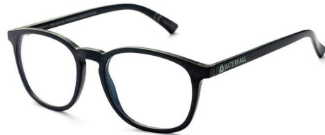
Kynance Frame Only