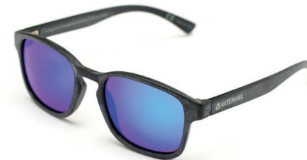
Pentire Blue Mirror (Mineral Glass Lenses - Polarised)