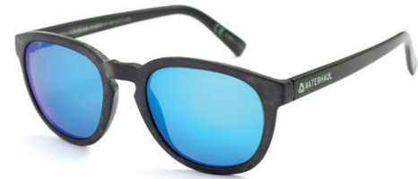
Crantock Blue Mirror (Mineral Glass Lenses - Polarised)