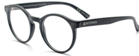
Harlyn Slate Frame Only