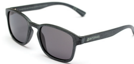
Pentire Grey (Mineral Glass Lenses - Polarised)