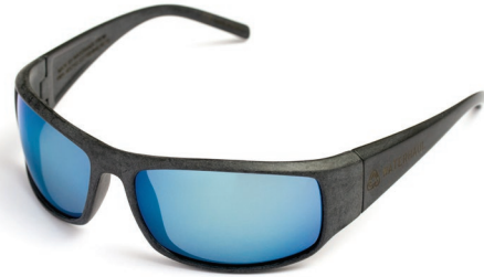
Zennor Grey (Polycarbonate lenses - Polarised)