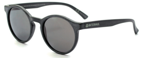
Harlyn Grey (Mineral Glass Lenses - Non Polarised)