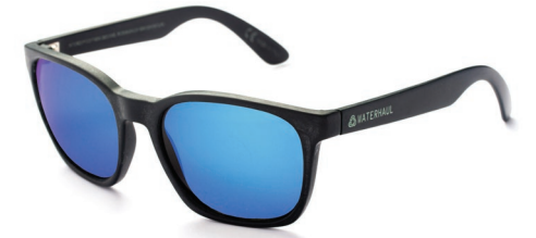
Fitzroy Blue Mirror (Mineral Glass Lenses - Polarised)